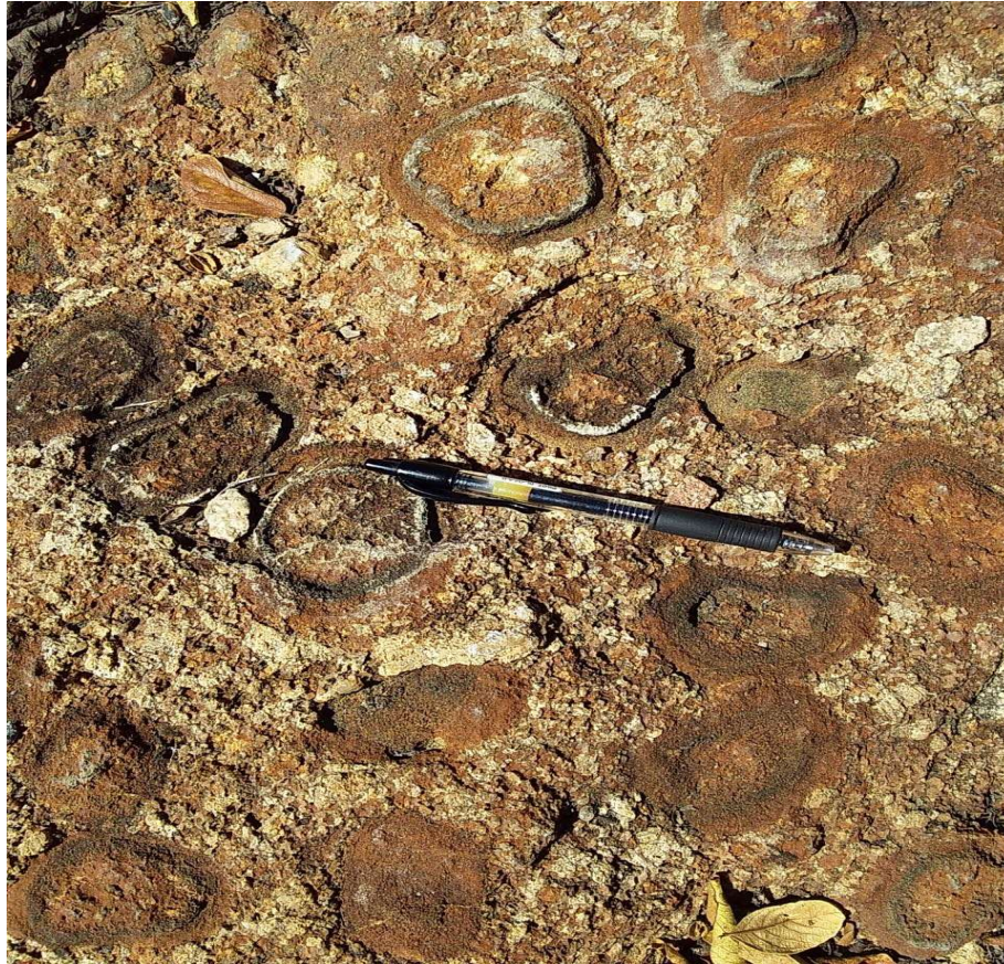
The Orbicular Granite exposure in the western Whovi section of Matobo National Park