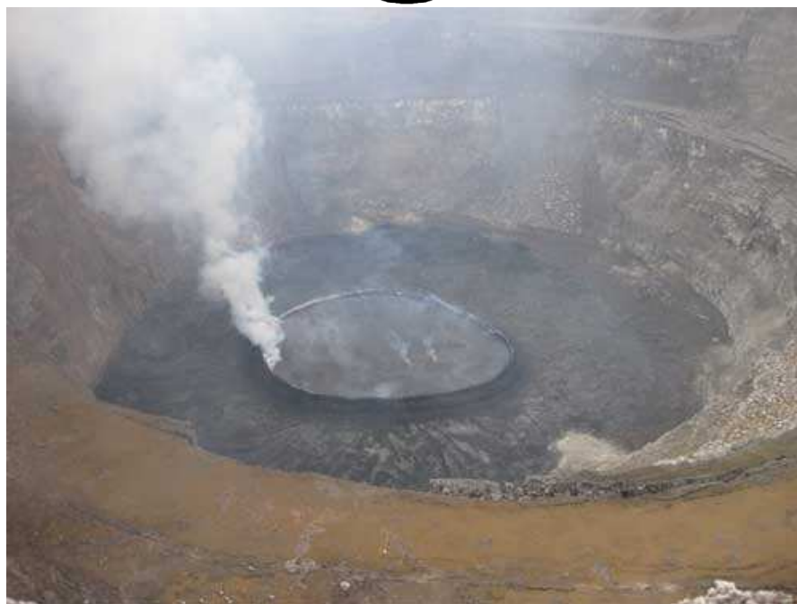
The lava lake of Nyiragongo, 3500 m, is about 200 m in diameter and some 800 m down in this active cone, the southernmost volcanic peak in the Virunga National Park north of Lake Kivu, DRC. Photo by Xavier Marchal, 2010

THE GEOLOGICAL SOCIETY OF ZIMBABWE, P.O. BOX CY 1719, CAUSEWAY, HARARE