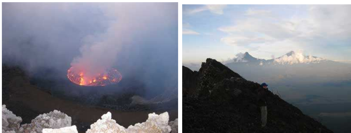
Fig 2: The Nyiragongo lava lake at night and view from the crater edge east-north-east to Mikeno (4,400m) in DRC and Karisimba (4,500m) in Rwanda.