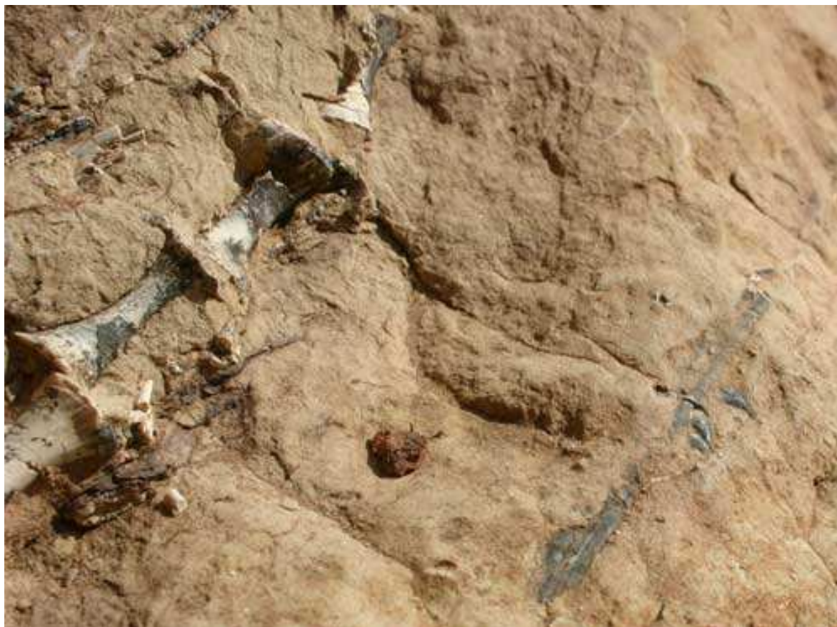
Syntarsus rhodesiensis - Distal section of caudal column and part of a maxilla

For the ongoing saga you will have to listen to the Hon Ed's presentation on recent activity in the fossil world of Zimbabwe at the Summer Symposium. The cover picture and that below should whet your apatite and raise your curiosity, so we hope to see you on Friday 30 th November at the Geology Department at UZ.