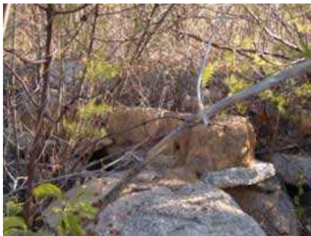
Ancient remains of a settlement – furnace or granary?

Sunday the 2 nd started reasonably early with a breakfast treat of egg rolls and tea before setting out for the day. This was a “ninga” day, these being old pit structures. Our first stop was at Kadzema farm site where an old “ninga” encouraged a lot of debat about what the structure was actually used for. The “ninga” remains are on a raised platform with a hole at the centre probably measuring 10 metres across. An adit about a metre in diameter enters this hole from a few meters away. The top of the hole could have been previously covered and there is evidence for a back outlet to the hole. There were two schools of thought, one being that it was some kind of “bunker” into which warriors retreated during battle. The other thought was that they were used as a gold processing “plant”. Traces of gold have been found within the “ninga” structures.