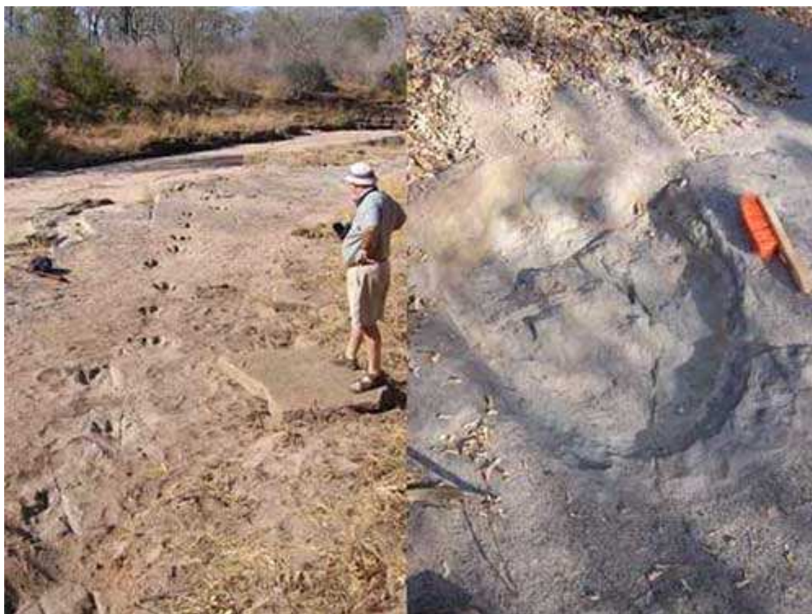
New Allosaurus and Brachiosaurus tracks, Ntumbe River, Chewore

THE GEOLOGICAL SOCIETY OF ZIMBABWE, P.O. Box CY 1719, CAUSEWAY, HARARE