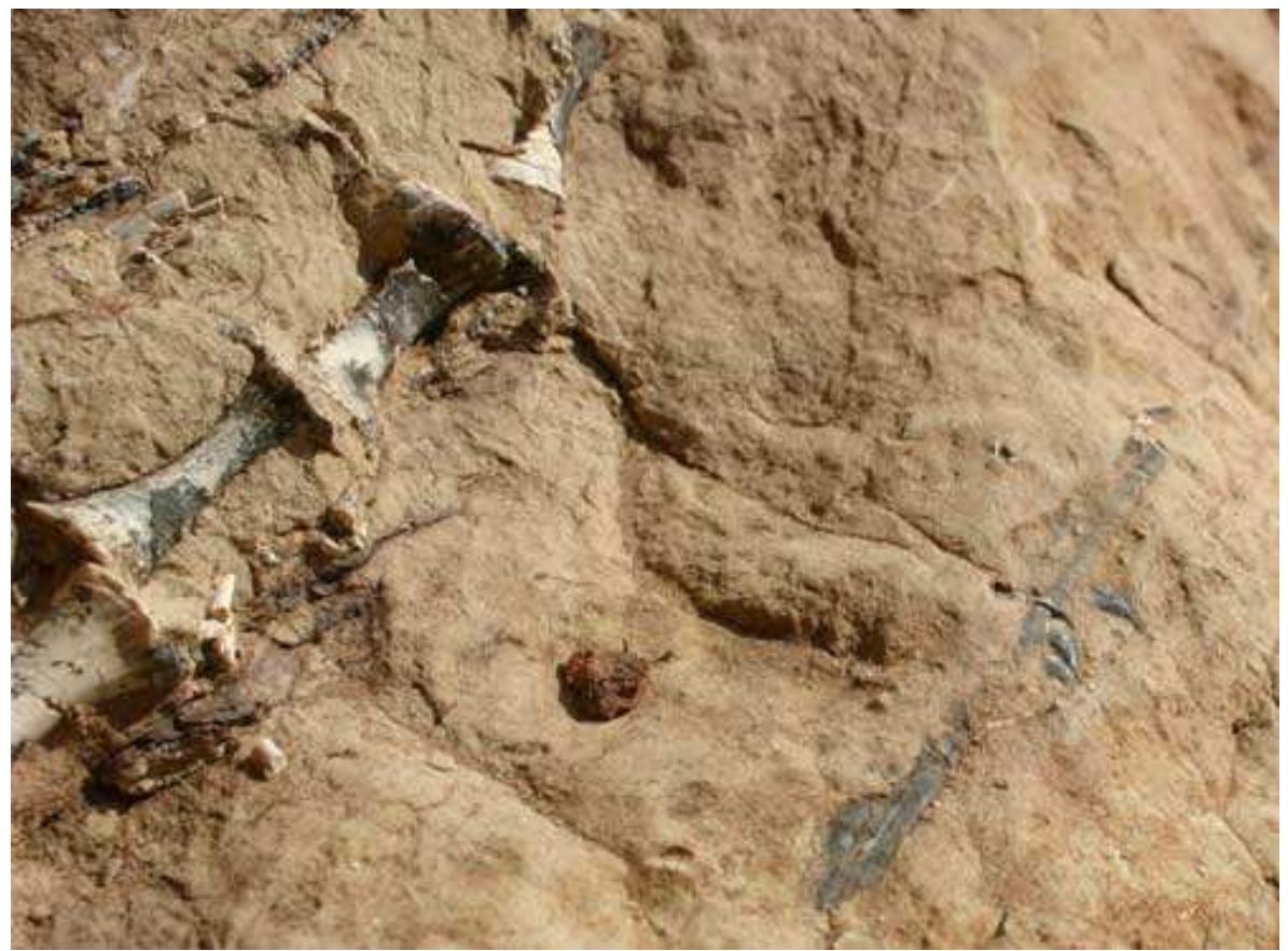
Syntarsus rhodesiensis - Distal section of caudal column and part of a maxilla

For the ongoing saga you will have to listen to the Hon Ed's presentation on recent activity in the fossil world of Zimbabwe at the Summer Symposium. The cover picture and that below should whet your apatite and raise your curiosity, so we hope to see you on Friday 30^{th} November at the Geology Department at UZ.