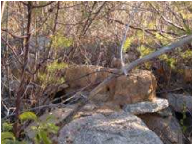
Ancient remains of a settlement – furnace or granary?

Sunday the 2<sup>nd</sup> started reasonably early with a breakfast treat of egg rolls and tea before setting out for the day. This was a "ninga" day, these being old pit structures. Our first stop was at Kadzema farm site where an old "ninga" encouraged a lot of debat about what the structure was actually used for. T he "ninga" remains are on a raised platform with a hole at the centre probably measuring 10 metres across. An adit about a metre in diameter enters this hole from a few meters away. The top of the hole could have been previously covered and there is evidence for a back outlet to the hole. There were two schools of thought, one being that it was some kind of "bunker" into which warriors retreated during battle. The other thought was that they were used as a gold processing "plant". Traces of gold have been found within the "ninga" structures.