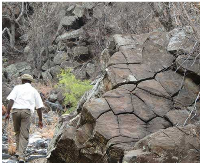
Columnar jointing in a peridotite sill in the “Hall’s Flow” exposure of the Reliance Formation, Belingwe Greenstone Belt, and Forbes for scale.

Perhaps the sequence that caught the imagination of most was that known as ‘Hall’s Flow’ through the komatiitic Reliance Formation, particularly the columnar jointing and both olivine and pyroxene spinifex textures.