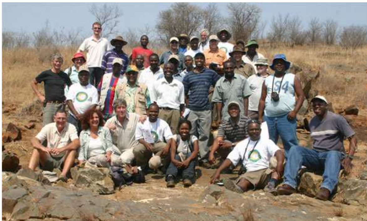
Participants on the Belingwe field trip, 23 rd – 25 th October, 2010.

THE GEOLOGICAL SOCIETY OF ZIMBABWE, P.O. BOX CY 1719, CAUSEWAY, HARARE