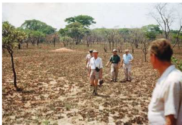
Figure 2: Chalimbana copper clearing, Zambia

For these reasons, the relatively new science of Geochemistry appeared to offer a real advantage, at first in the zone of weathering and later for blind deposits hidden deep in the bedrock. Some