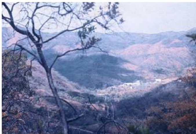
Figure 1: The Shamrocke Copper Mine

A sometime tobacco farmer, a cheerful optimist, had found Shamrocke and was never discouraged even when the deposit was drilled by Rand Mines to reveal a jumble of drag folds in every core. There was a problem of interpretation until the simple solution was tested, and accepted, that soft rocks were caught in a planar structure. This was one limb of a steep fold, and where was the other? There was no treasure trove at Shamrocke 50 years after Mr Beaton's adventure, but the mine was opened with Government assistance and exploited by Lonrho until the war (6) , fig.1.